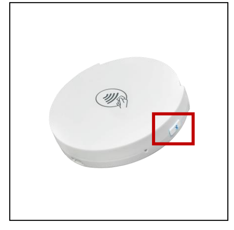
Bluetooth Button (at the right side)